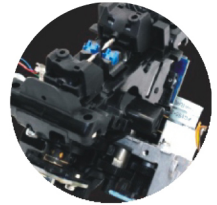
Integrated fiber-adjust frame

Built -in Japanese components and Korean chipset